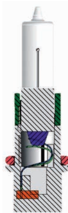
Positive contact plate in the 2 two positions: at rest and under pressure (blue and green position)